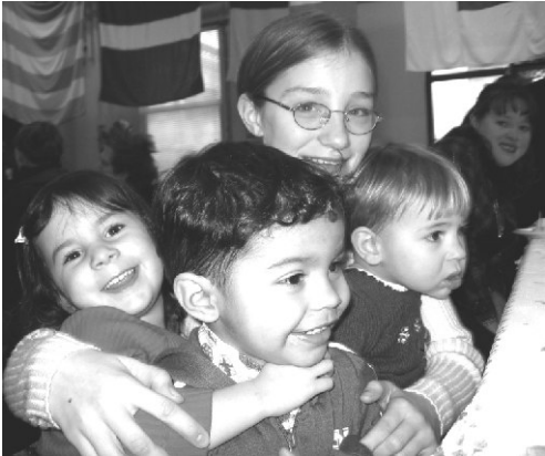
It's a "little bit" Christmas