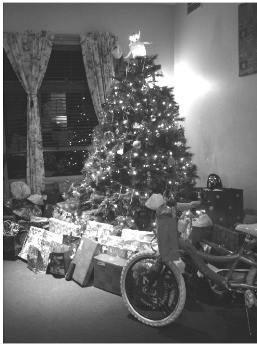
'Not a creature was stirring...'