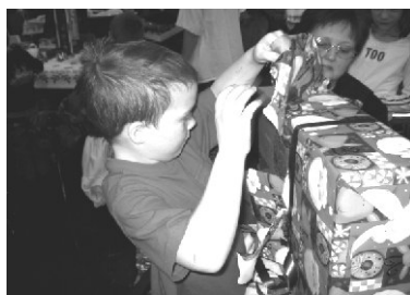
Santa's little helper