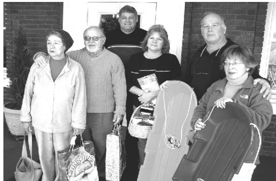
Let it snow, let it snow, let it snow