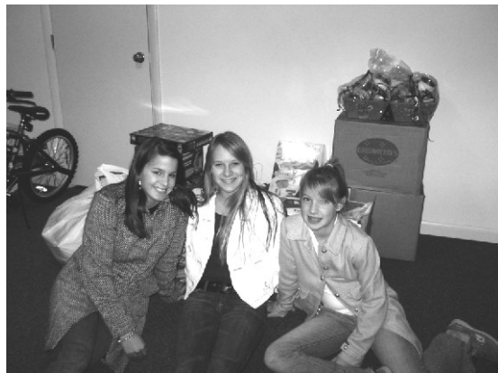
Three wise girls sharing gifts!