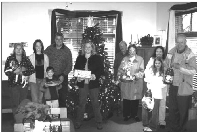
A Waldensian Christmas