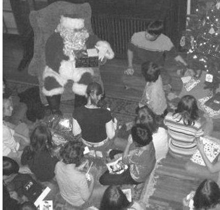
'Twas the night before Christmas...'