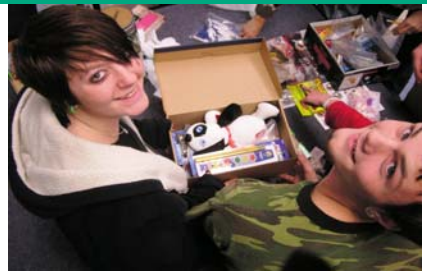
Youth filled shoeboxes for Operation Christmas Child.

" Grew produce for local charities. " Partnered with Black Mountain Presbyterian Church to provide Thanksgiving meals for families in need. " Adopted Highland Farms residents without families of their own for Christmas and Valentine's Day. " Volunteered with Meals on Wheels. " Completed volunteer work days at a home for handicapped foster children in Madison County and at a shelter for homeless women and children.