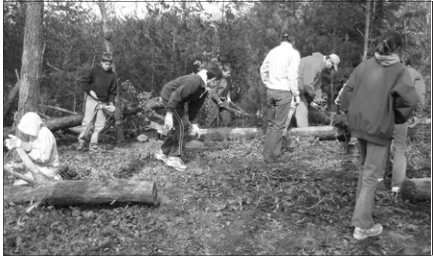
Clearing the way for future enjoyment.

PHFC has a 17+ acre plot known as the "Mountain Property" on land behind Charles D. Owen High School in need of a trail to and through it. Cedar Springs volunteered to tackle the daunting task. Conditions were brutal, with the proposed trail