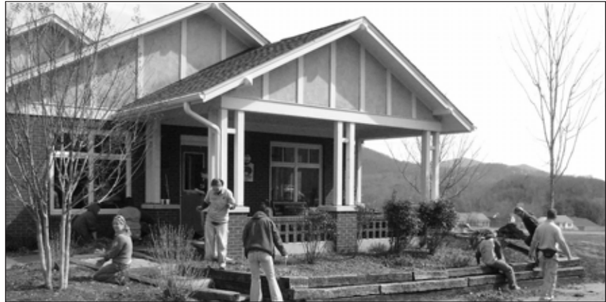
PHFC youth and volunteers tidy flower beds at Parks House.