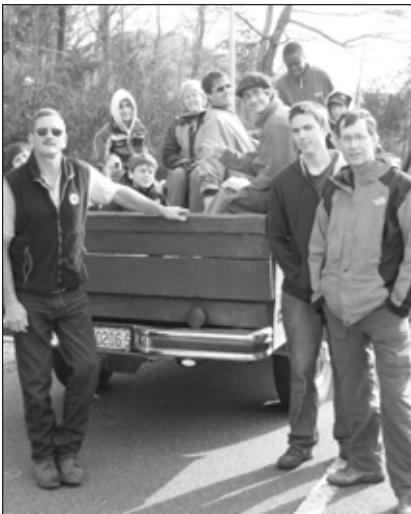
Heading up the mountain.

Our deepest appreciation goes out to Cedar Springs Presbyterian Church.