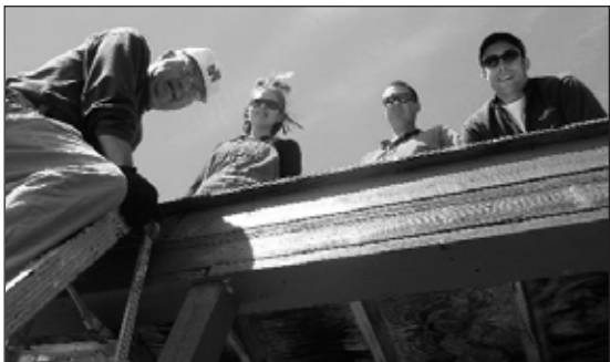
Volunteers reroofing the baseball dugout.

Finally, youth and volunteers ended the afternoon with an extra large game of dodgeball.