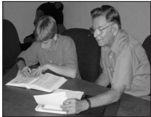
Hitting the books with a little extra help.

Dinner will follow the program in the campus Community Room. Highlights