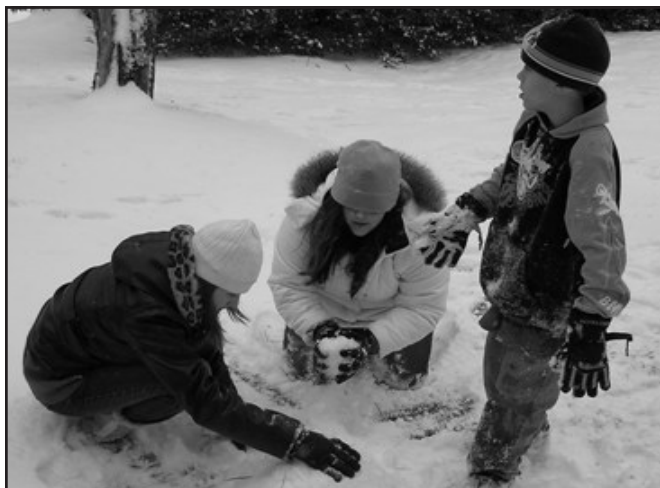
Stockpiling snowballs for that battle coming up.

The leadership team traveled from Black Mountain, NC, to Boone in three vehicles. This was an opportunity for the youth to have fun. They left at 10:30 a.m. in the morning and the first stop was Linville Falls.