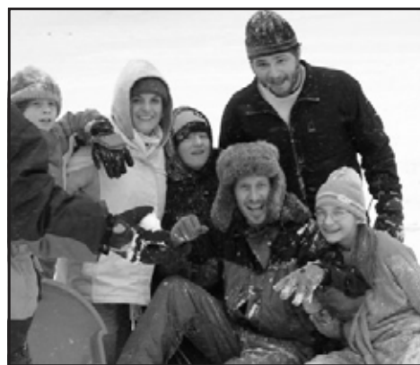
Fun in the snow with the team.