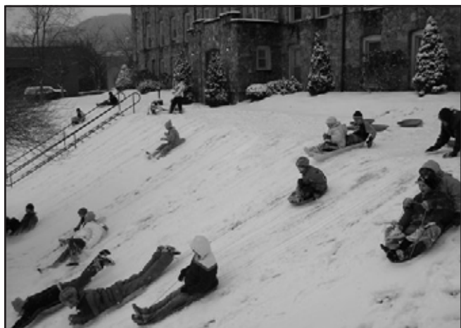
Everyone hits the hill at once for great sledding.