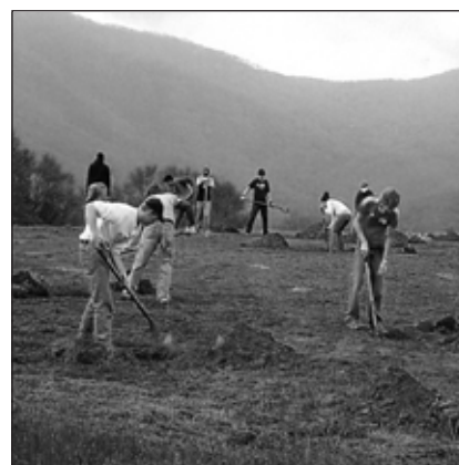
Planting apple trees.